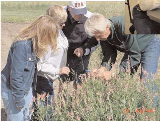
Student at the Summer Institute learn about the diversity in agriculture. These pictures show them preg checking cow, learning about plant research at CSU ARDEC Research Center and learning how to build mini-greenhouses for their classroom.