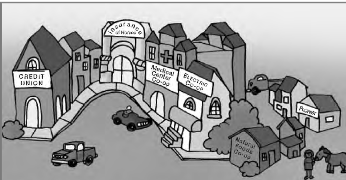
All of the businesses above are cooperatives. How many can you count? 6

various needs using appropriate parliamentary procedure to insure order. After all suggestions have been made, eliminate those that are in the unrealistic price range. Now vote on the final decision with a majority (one more than half) required. Continue to vote until a majority is reached to illustrate the majority rules principle.